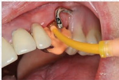
2. Insert the partial and assure that it is properly seated. Inject medium body material around the prep.