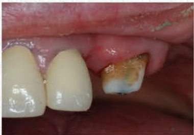
1. Prepare the tooth for a crown and take the usual working impression.

When a tooth abutting a partial requires crowning, the dentist traditionally sends the partial with the case to the lab. This requires the patient to be without the partial for a week or two. The following (in office) technique uses a medium body material to register the clasp-tooth-relationship. As a result, the patient never has to be without their partial.