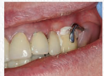
8. Cement the crown and immediately seat the partial. Wait until cement cures and then remove the partial and excess cement.