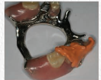
4. When the impression material has cured remove the partial with the material. Trim away material until outer surfaces of the clasp and rest are exposed. Remove the index from the partial by pushing it in an apical direction.