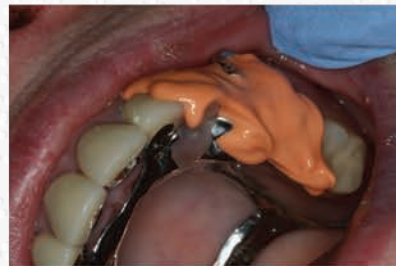
3. Continue expressing material until clasp and rest are covered.