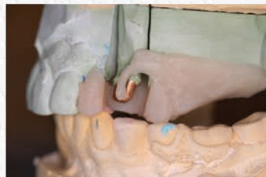
6. Prodenco will make a resin reproduction of the clasp.