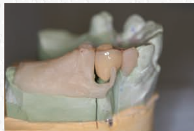
7. The lab will fabricate a crown to the clasp dimensions